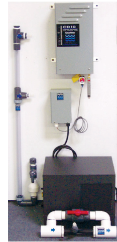
Apex series IV— shown with Oxygen concentrator